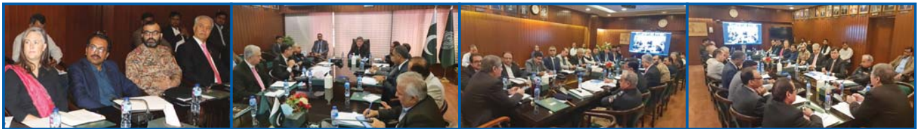
Meeting with CS at the Sindh Secretariat on Nov 23rd

The closing remarks were given by CS Sindh, he thanked the polio partners for their time and commitment. The meeting was concluded with a pledge to intensify efforts and collaboration.