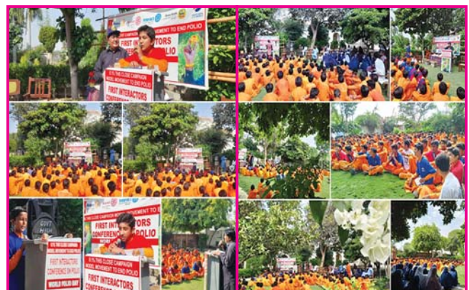
First Interactord conference in Khipro

The conference was primarily to engage the youth of the country to join Interact clubs and spread awareness on polio.