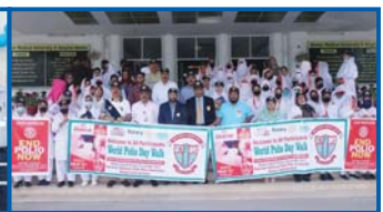
WPD walk arranged by RC Multan Chenab on WPD