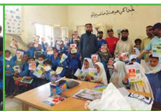
Students of Mirpurkhas Govt School with Rotarians