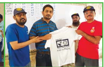
Giving Polio tshirt to teachers of Govt school

oral polio vaccine for each child under the age of five years. Teachers and students were handed social mobilization items including toffees and face masks. This activity was to promote Rotary Public Image through Health & Hygiene and End Polio Now awareness in Govt villages side school.