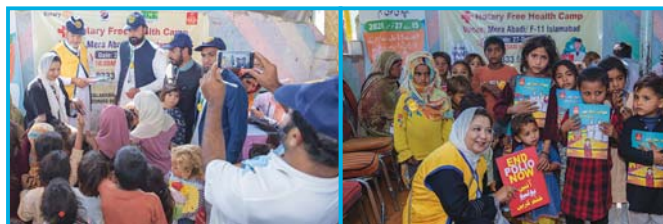
Health Camp by RC Islamabad Metropolitan

The primary goals of this noble initiative were to extend medical aid to the most underserved segments and those that are unreached children during polio campaigns. The camp facilitated general check-ups to over 500 individuals, including 130 children, 220 women, and 50 men. Furthermore, 30 children received essential Polio drops, while 50 others were administered Routine Immunizations. The unwavering dedication of EPI technicians and CDA staff played a pivotal role in the success of the health camp.