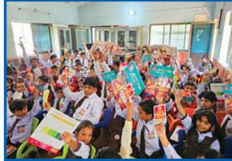
Happy children on receiving polio giveaways

gave awareness on the importance of two drops to eradicate polio from Pakistan. The children and teaching staff were given biscuits, chocolates and polio mobilization items by the President and members of RCM Satellite Town.