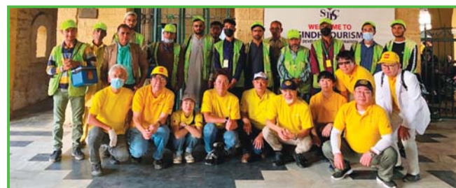
At Railway station