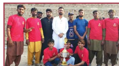
RC Khairpur Dominators

A super-8 inter Polio Free Pakistan cricket tournament was held by RCK Dominators with 88 players participating from different Taluka villages.