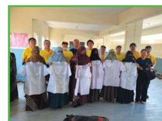
Coats distribution to plio workers at Site Town