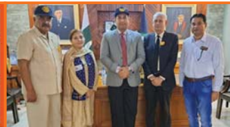
Meeting with Vice Chancellor of the University in RYK