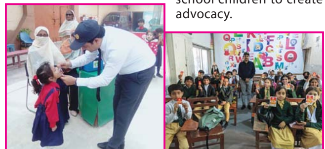
President of Mango city giving OPV to a student

RCM MC participated in the polio campaign with Polio frontline workers and distributed social mobilization to school children to create advocacy.