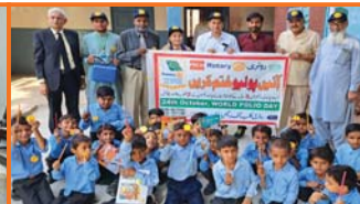
RC RYK with students on WPD