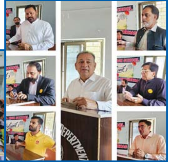
Speakers at Mashal high school