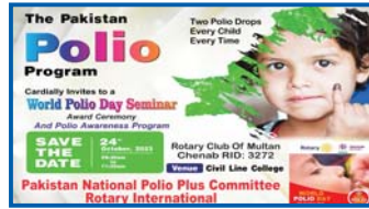
Multan seminar banner on WPD seminar