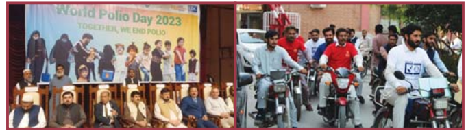
WPD seminar in Rehman Medical University Auditorium Peshawar

5. Polio awareness seminar at Rehman Medical University Auditorium Peshawar: The seminar was attended by over 100 people, which included health professionals, government officials, and community members. In addition, residents of Peshawar City, health professionals, Government officials and community members