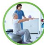
Physiotherapy & Rehabilitation