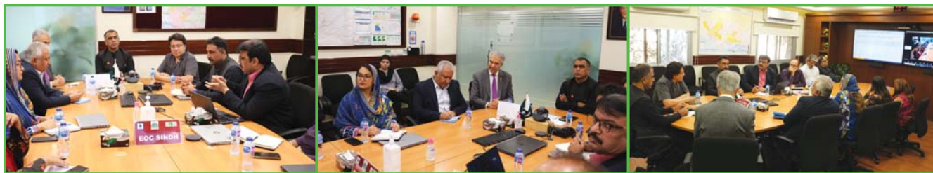
Meeting at EOC Sindh with Polio partners