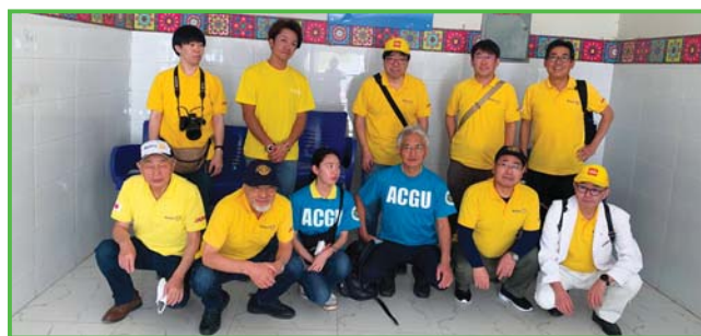
At Team support Center Landhi

A visit to the coastal slums of Karachi was planned in District East. A Team Support Center in Landhi was visited, where polio workers were in training. Thereafter, the delegation visited house-to-house campaign in a village called Ibrahim Hyderi. Each Rotarian was accompanied by a polio vaccinator to enable them to administer OPV to children.