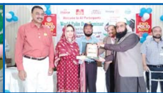
Recognition ceremony on WPD Multan