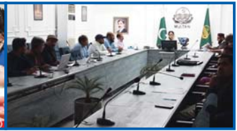
DPEC meeting in Multan