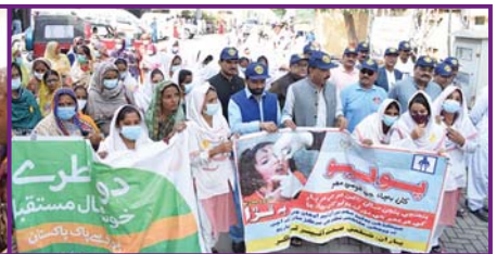
Walk by all concerned in Mithi on polio