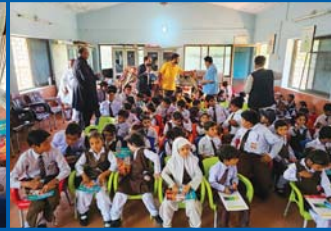
Mashal school children in Mirpurkhas