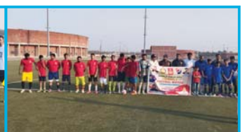
WPD celebration in Sukkur