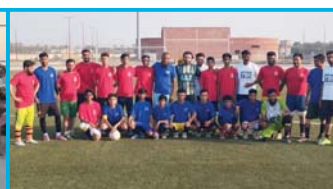
Footballers in Sukkur