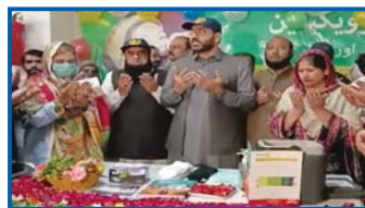
Inauguration of NIDs in Multan